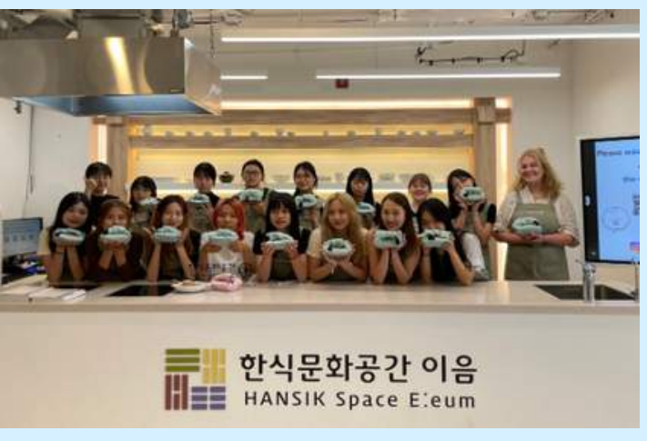
Korean Cooking Class