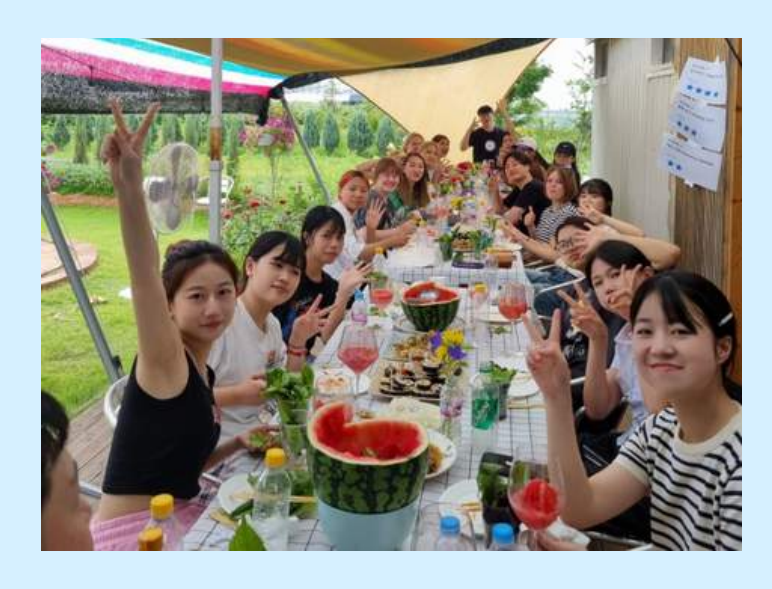
Korean traditional games and Food