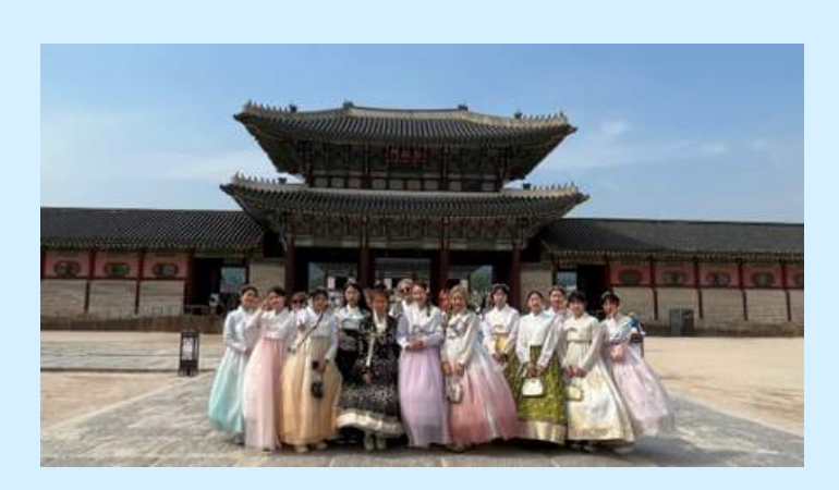
Hanbok experience in the Old Royal Palace