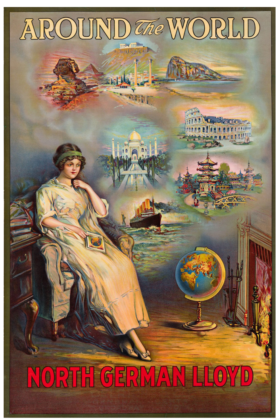
Poster advertising the North German Lloyd shipping company, circa 1910, lithograph, imp. © The Sackett & Wilhelms Co., New York, 76x50 cm.